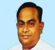
Shri Pendekanti Venkata Subbaiah Former Minister of State for Home & Parliamentary Affairs, Governor of Bihar and Karnataka, Founder of SHE & CS., Sanjamala.